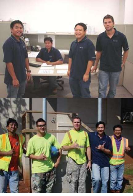
Some of the Hard Working MACC Team Members