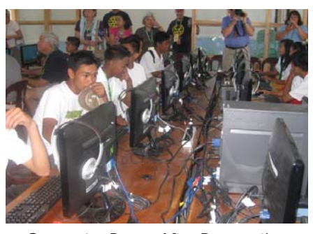
Computer Room After Renovations

and then get angry at the same time, about how ridiculous it was. But of course, within the first day he also solidified his position as the one able to get the most nails in without bending!