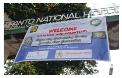
Warm Welcome to Lepanto

The warm welcome and hospitality of the Filipino people at Lepanto was unparalleled. As soon as we arrived, even