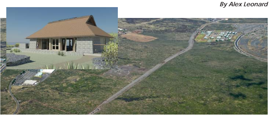
Aerial Photo of Ane Keohokalole Highway & Rendering of Cultural Museum

As we all know, Hawaii is home to numerous unique species of plants and animals; our project site includes many. The endangered Hawaiian Hoary bat roosts and raises its young in kiawe trees growing in and around the site, requiring us to implement special procedures to safeguard Hawaii's only native land mammal. This includes restrictions throughout the year regarding when we are able to cut down trees and when we are able to work at night with tower-lights. There are also at least four (4) endangered tree species located throughout our job site, of which the most critical -the Aiea- is counted in low double digits worldwide. To ensure that this fragile ecosystem is not harmed by the road project but rather in the hope of seeing it flourish, our contract also includes establishing a 150-acre native dryland forest populated with seedlings from these endangered species of trees.