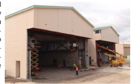
F-22 LO/CRF Progress Picture

With the ultimate goal of providing a quality project completed on time and within budget, the team will keep pushing forward to ensure yet another successful project for the HIANG and USPFO is attained. Nan Inc