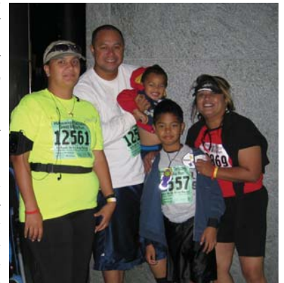
Getting Pumped for the Great Aloha Run