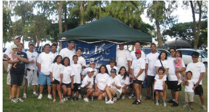
Team Nan, Inc. all smiles after finishing the Oahu Heart Walk

Following our company picnic in July, our most recent event involved participating in The American Heart Association's 2009 Oahu Start! Heart Walk. Another opportunity to benefit both our health and the community, the Safety Committee headed and helped with this event, which took place on Saturday, August 1, 2009 at Kapiolani Park. The turn out was much better than the GAR, as our approximately 50 participants had the option of either a 1-mile route around the park or a 4.5-mile around Diamond Head. Once again, a big "MAHALO" to all of those who supported by contributing to and/or participated in the