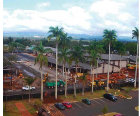
COF13 Hardstand Readiness Building & Administration Building

As with all Nan projects, safety is a priority. Since the issuance of the Notice to Proceed in October of '07, this project has experienced ZERO lost time accidents (over 650 consecutive days and over 200,000 man hours worked). With this safety record, the field workers were recognized with a Jobsite Safety Recognition Event where food and rewards were presented to our field workers, as well as the project received recognition from the Government and Atlas Insurance Company.