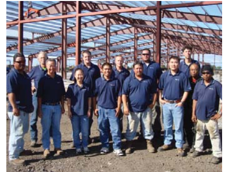
Keaukaha Team in front of the Administration/Unit Storage Building

the emergency generator. The assembly hall/physical fitness building includes a gymnasium, physical fitness room, locker/shower room, and kitchen. The classroom building includes a distance learning center, library/classroom, learning center, break room, and four classrooms. The vehicle maintenance building includes administration offices, supply rooms, tool rooms, battery rooms, library, and a break room including four work bays and an unheated storage room. The state maintenance building includes administrative offices, supply room, maintenance shops, and covered parking.