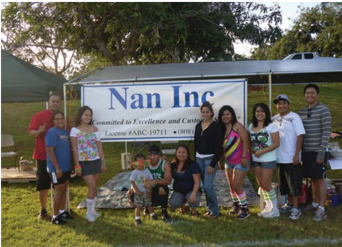
Team Nan, Inc. ready to "Relay For Life"