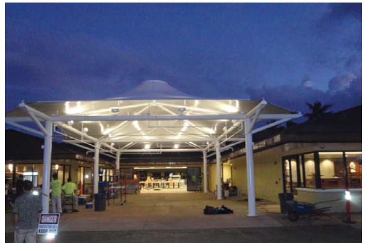
New tension structure for Klipper Club House renovation, designed and installed by Tropical J's

This unique design-build project required a strong working relationship with the Marine Corps Community Services (MCCS), who were heavily involved in the decision making process from the beginning. MCCS's input and vision were key to the luxurious country club look of the project. It was a team effort from MCCS, the Kaneohe ROICC team, and the Su-Mo/Nan JV team to ensure that the end product was what MCCS envisioned.