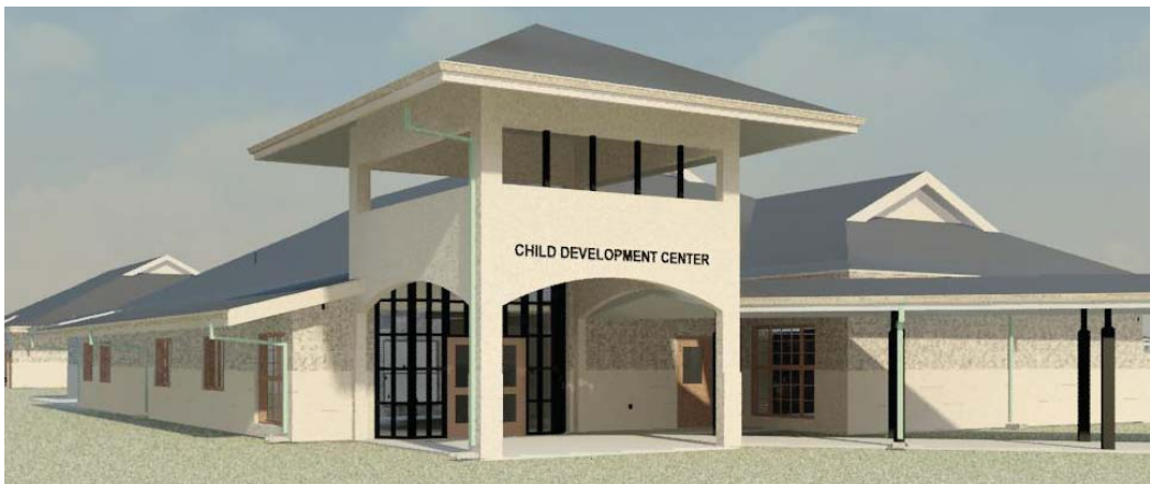
Rendering of Kaneohe Marine Corps Base Hawaii Child Development Center