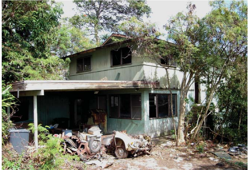
Before (above) and After (below) pictures of Client Home