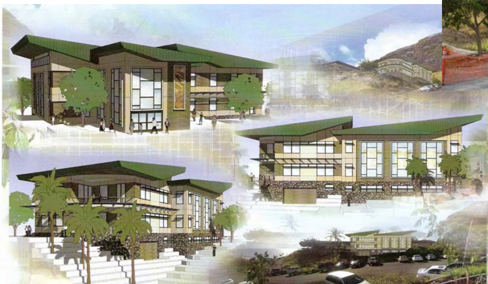
Pictured to the Left: Architect's Perspective of the Family Medical Center