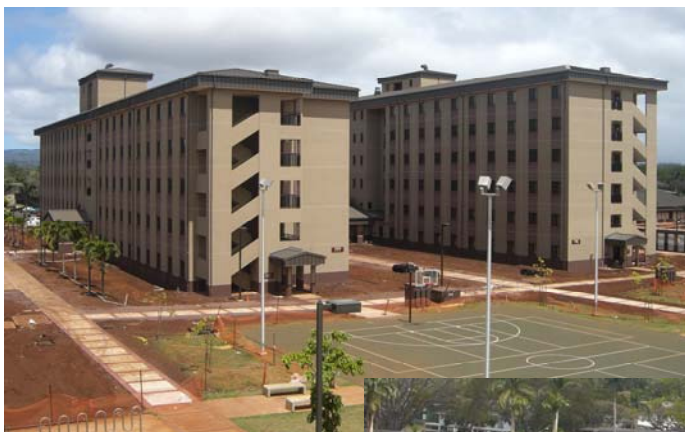
Barracks (top left) and Headquarter (bottom right) buildings