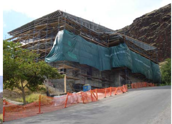
Pictured Above: Progress as of March 2008

Waianae Coast Comprehensive Health Center, or WCCHC, is located on the side of the canyon overlooking the beautiful Maile Beach. The project started on August 1, 2007, with a completion date of June 30, 2008. The total area of the building is 20,244 square feet. and will become the first full-service family clinic of WCCHC. Nan Inc