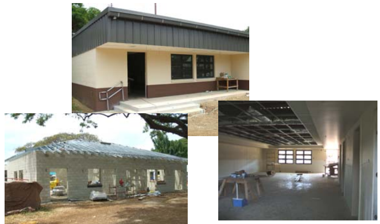
Pictured (clockwise, from top): Exterior and Interior of Child Care Development Center, Bldg. 1654; and Child Care Development Center, Bldg. 1597.