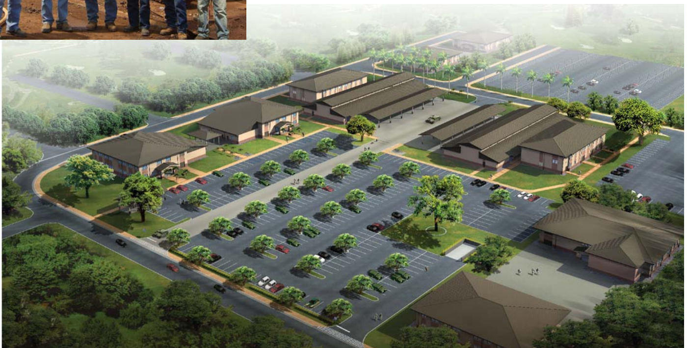
Pictured Below: Bird's Eye View Rendering of the Completed Project Site