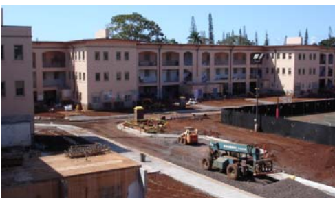
Building 551 and Courtyard of Quad E

Construction on this $30 million dollar renovation project commenced in October of 2006 and is scheduled to be completed