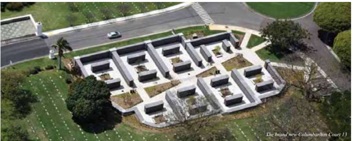
The brand new Columbarium Court 13