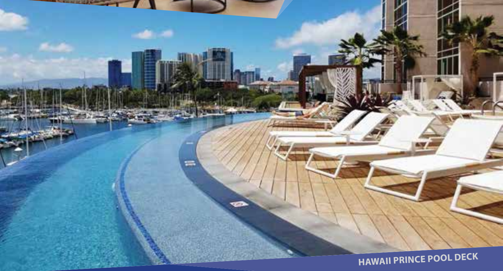
HAWAII PRINCE POOL DECK