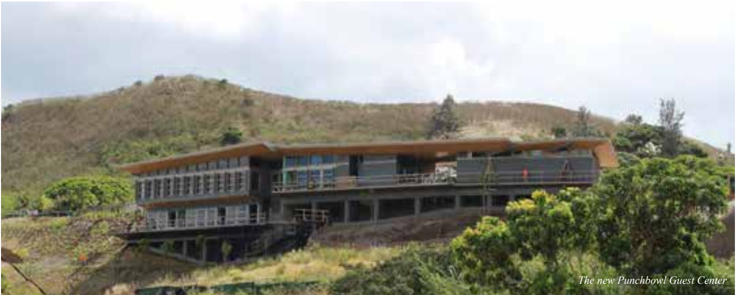
The new Punchbowl Guest Center

niches. In particular, once all project work is completed in mid-August 2017, this addition of resting spaces will allow many more veterans’ families to inter their deceased loved one’s remains in this iconic and sacred monument. What a great honor it is for Nan, Inc. to be part of this project and give back to the many veterans who sacrificed so much.