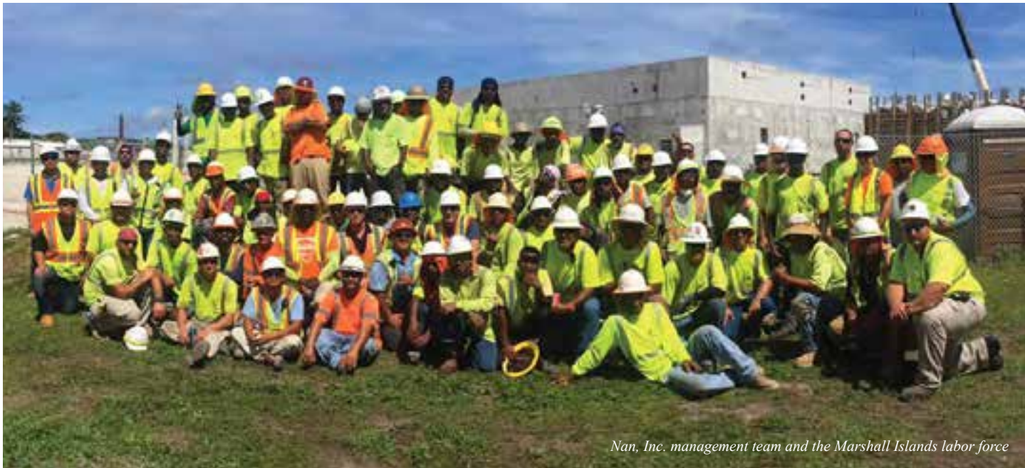
Nan, Inc. management team and the Marshall Islands labor force

Most people dream of living on an island. But how about taking it a step smaller and living on island that is part of an atoll? Well, some of our Nan, Inc. personnel are doing just that by performing work and living on Kwajalein Atoll in the Marshall Islands. Oh, and you know, all the while helping to build a very important Space Fence. Sounds cool, right?