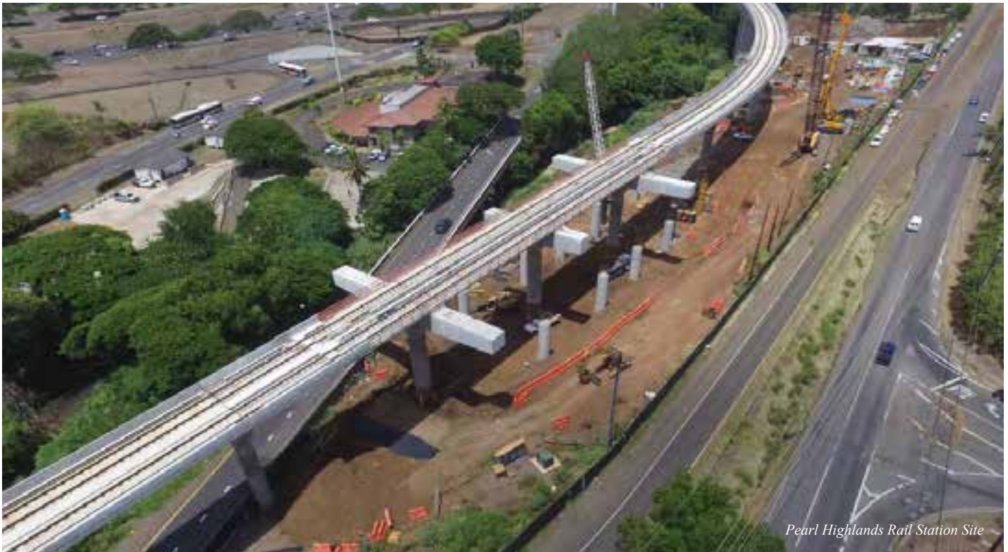
Pearl Highlands Rail Station Site

A major milestone. A turning point. A game changer. Call it what you will. But Nan, Inc.'s incredible journey of growth has taken a huge leap forward after being awarded the contracts to build the West Oahu Stations Group (WOSG) and the Kamehameha Highway Stations Group (KHSO) for the Honolulu Rail Transit Project.