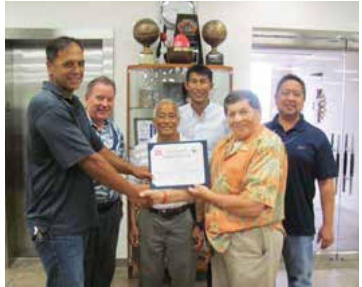
Certificate of Accomplishment - Schofield Barracks Quad B