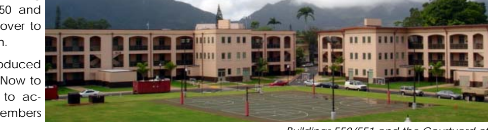
Buildings 550/551 and the Courtyard of Quad E

In the previous issue, we introduced our project management team. Now to close out this project, we want to acknowledge the other important members of this project, our Design Team: