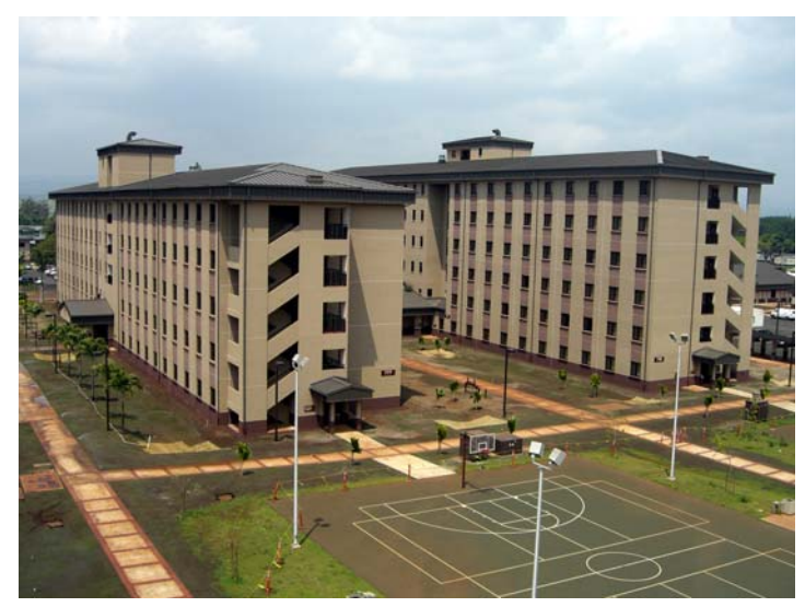
Completed Five-Story (left) and Six-Story (right) Barracks

As the company's largest single project to date, the 2E/2F1 project consisted of a six-story 120-room high rise barracks buildings, a five-story 100-room barracks building, two 2story battalion administrative buildings, a single-story brigade building, a central plant building, access roads, and several parking lots. With over 616,000 exposure hours and an average of 200 field personnel working together everyday, the successful implementation of the safety plan resulted in zero loss time accidents and zero mishaps. This was only possible with continuous team efforts that earned a project status of being "not just good, but excellent". The experience gained from this project benefited, not just the project team, but the entire company. One evidence of this is in the latest insurance Experience Modification Ratio (EMR), which has decreased significantly, reducing our company's insurance premium! The 2E/2F1 team wants to acknowledge the fact that this accomplishment could not have been achieved without a number of other factors, including the safety efforts at the other jobsites,