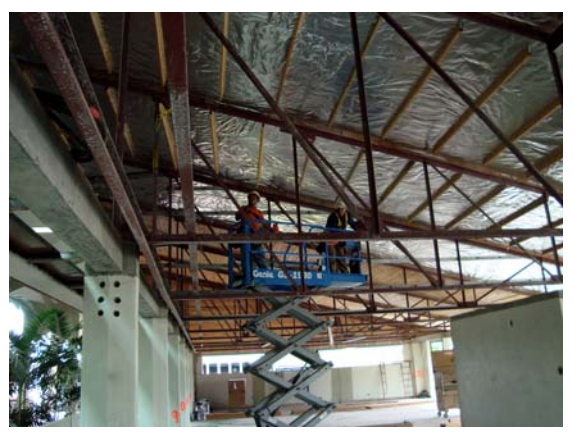
Ongoing work within the Hawaii County Building Renovation project