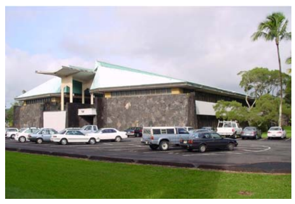
Hawaii County Building circa 2005

The decision to expand to the island of Hawaii was the result of strategic planning efforts by the company's officers, after reviewing the economic and market trends within the State. Numerous opportunities exist there with limited competition, and it would benefit the company to take advantage of such opportunities. The military continues to rely on Pohakuloa as a critical training area, and it is anticipated that the Federal Government will continue to expand and upgrade their training facilities there. Hawaii Community College, currently based in Hilo, is in the process of building a University of Hawaii-West (UH-West) Hawaii Campus on property owned by Charles Schwab. The new UH-West Hawaii Campus for Hawaii Community College is incorporated into the 725-acre master planned community by Schwab and his partners. Several new resorts are planned, and may become a reality if they are successful in overcoming strong objections from environmentalists. Nan, Inc. believes that this investment through expansion is an investment in the future growth of this locally owned and operated construction company.