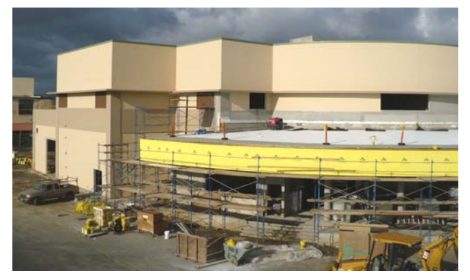
Current progress picture of Pacific Warfighting project

Since our last newsletter article, we have completed the mat footing, concrete slab-on-grade, 1st and 2nd floor CMU walls, 2nd floor and roof structural steel, joists and metal decking, and the upper and lower roofs. It seems like only yesterday that we were pouring 1,000 cubic yards of concrete at 4:30 in the morning for the 1st mat footing pour! From all of us at PacWar, big mahalos to everyone that woke up early and gave up their Saturdays to help us make the two biggest Nan, Inc. concrete pours go smoothly and safely.