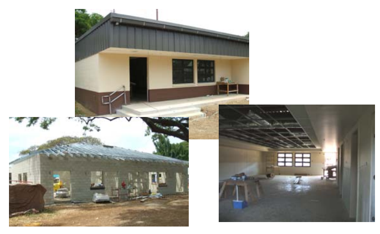
Pictured (clockwise, from top): Exterior and Interior of Child Care Development Center, Bldg. 1654; and Child Care Development Center, Bldg. 1597.